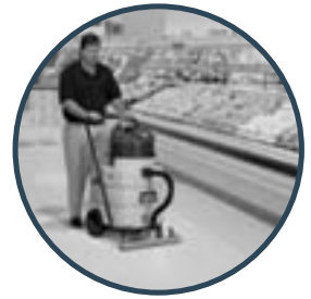
The Titan 720TP is for large capacity jobs needing tip-and-pour capability.