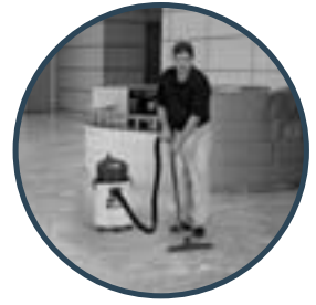
The Titan 708 is a utility vacuum for quick pick-up jobs.