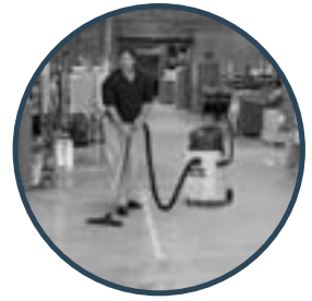
The Titan 716 is a multi-use vacuum for large jobs.